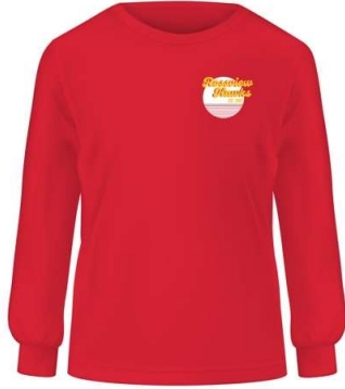
FRONT Imprint Size: 4 X 3.2 in.

Last day to purchase sweatshirts will be January 31st.