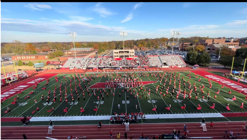
Congrats to several members of the Rossvie Marching Band of Pride for their performance in the 2022 APSU GOMB Day! There was over 400 students on the field Saturday!