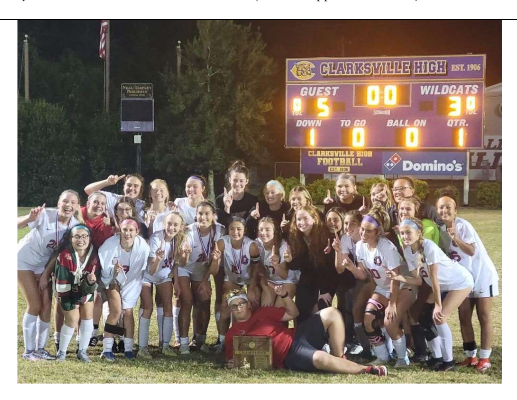
Congratulations to our Lady Hawks Soccer Team! They defeated CHS 5-3 to be the D13-AAA District Champions!

May 1-5 breakfast, lunch, or snacks (Teacher Appreciation Week)