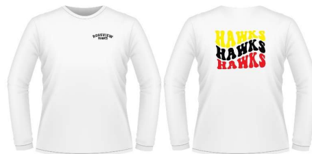
FRONT Imprint Size: 3.5 X 0.9 in.