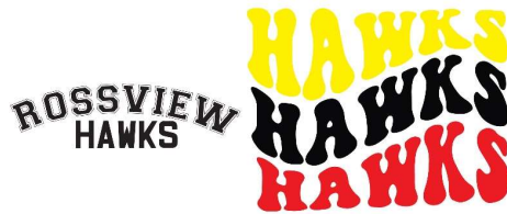
BACK Imprint Size: 10.5 X 8.1 in.