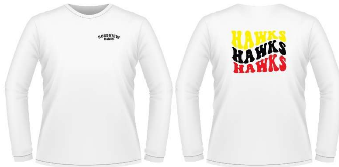
FRONT Imprint Size: 3.5 X 0.9 in.