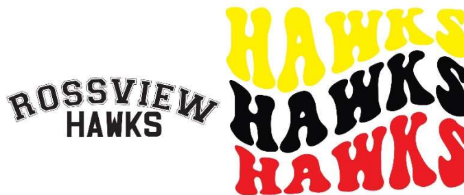
BACK Imprint Size: 10.5 X 8.1 in.